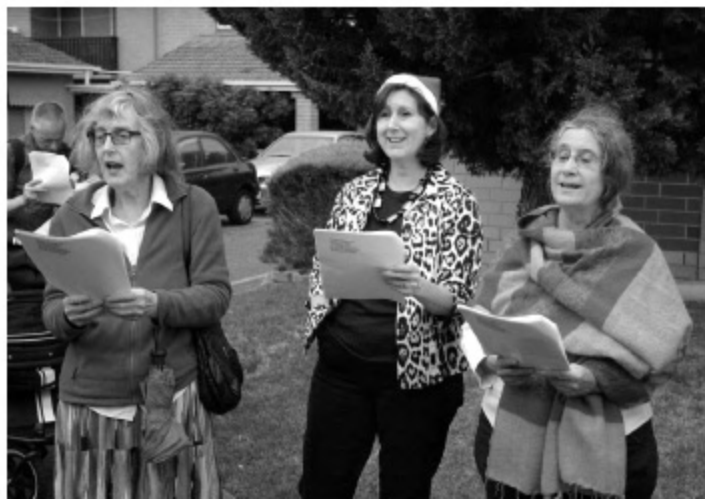
Christmas Carols: Some local choristers in full voice

Plenty has been happening around Kensington over the holiday season. The KRA and the Kensington Arts Group have been busy organising events and activities. Keep your eyes open for more upcoming events.