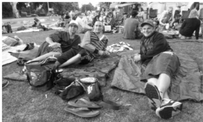
What a way to celebrate Australia Day – good company, a picnic, a swim and watching 'Million Dollar Mermaid' at the Kensington and Norwood Pool. Congratulations to the Kensington Arts Group.